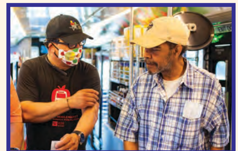
TCMM staff and shopper on board the Mobile Market

Visit thefoodgroupmn.volunteerhub.com to learn more and sign-up. Or contact Colette Illarde, our new Volunteer Coordinator at cillarde@thefoodgroupmn.org or 763-450-3889. We'd love to connect with you!