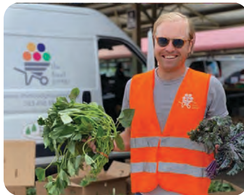
A volunteer collects produce from the Minneapolis Farmers Market to deliver to food shelf partners.